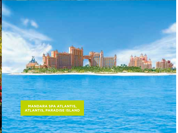
MANDARA SPA ATLANTIS, ATLANTIS, PARADISE ISLAND