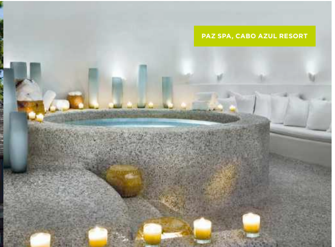
PAZ SPA, CABO AZUL RESORT